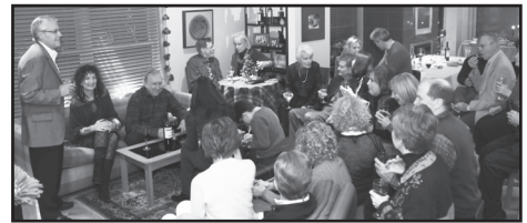
PHOTO CLUB CHRISTMAS PARTY

The theater's second offering this season will be "Baby" , a heartwarming musical told from the perspective of three different generations. The final play of 2013 will be "Vigil" a moving comedy about the "end"...but the real question is: "Whose end is it?" Check the website ( www.cherrycreektheatre.com ) for ticket information.