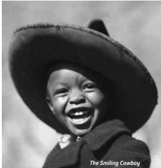
The Smiling Cowboy