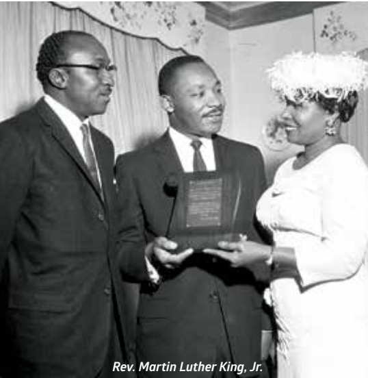
Rev. Martin Luther King, Jr.